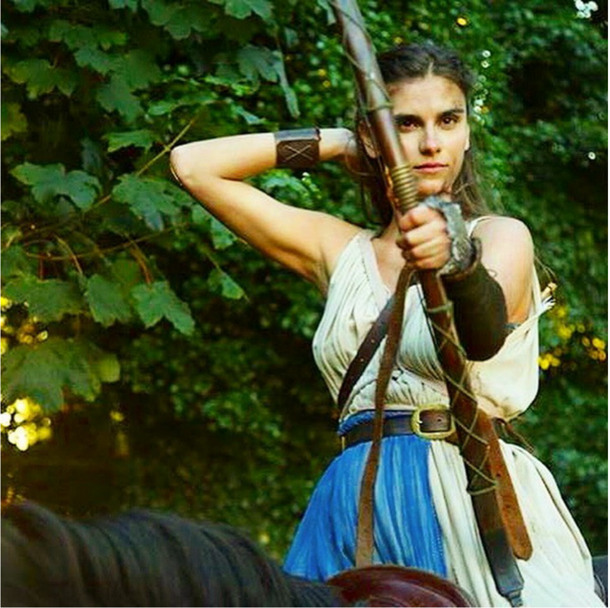
Lara in action in the movie