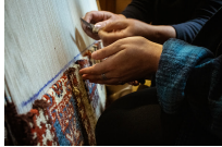
A recent Airbnb study found that over 80% of Millennials, who travel and spend more than any previous generation, are looking specifically for unique experiences abroad.