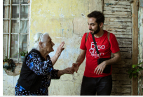
As we travel across Armenia to create new and exciting travel experiences, we're sharing our findings on Instagram . Follow us there if you're not already to join the adventure and stay here.

Source: World Tourism Organization, World Travel & Tourism Council, World Bank Group, Airbnb.