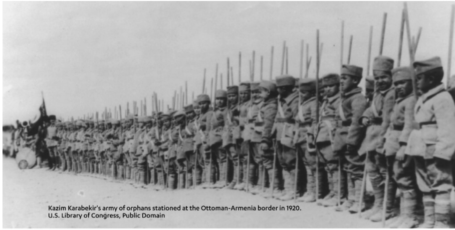
Kazim Karabekir's army of orphans stationed at the Ottoman-Armenia border in 1920.