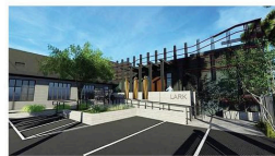
Lark Cultural Annex, Exterior Rendering