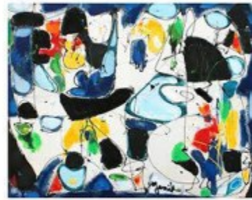
"Untitled, 57.5"x47", oil on canvas

WWW.STEPHANIESGALLERY.COM Gallery Hours: Monday - Saturday, 10:00 a.m. - 6:00 p.m.