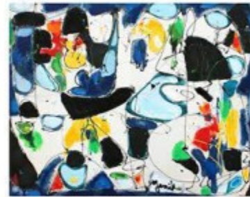
"Untitled, 57.5"x47", oil on canvas

WWW.STEPHANIESGALLERY.COM Gallery Hours: Monday - Saturday, 10:00 a.m. - 6:00 p.m.