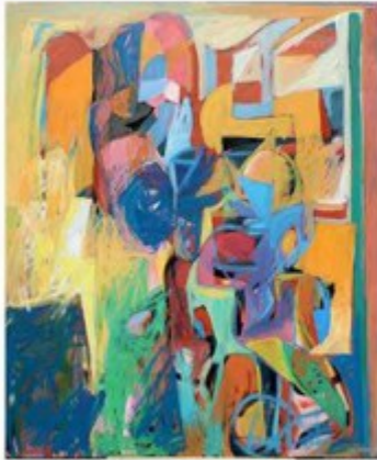
Sanasar & Baghdasar. 1992. Acrylic on canvas, 40x48 in.