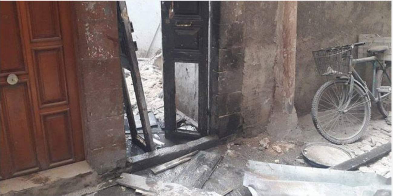
A scene from the aftermath of one of the attacks