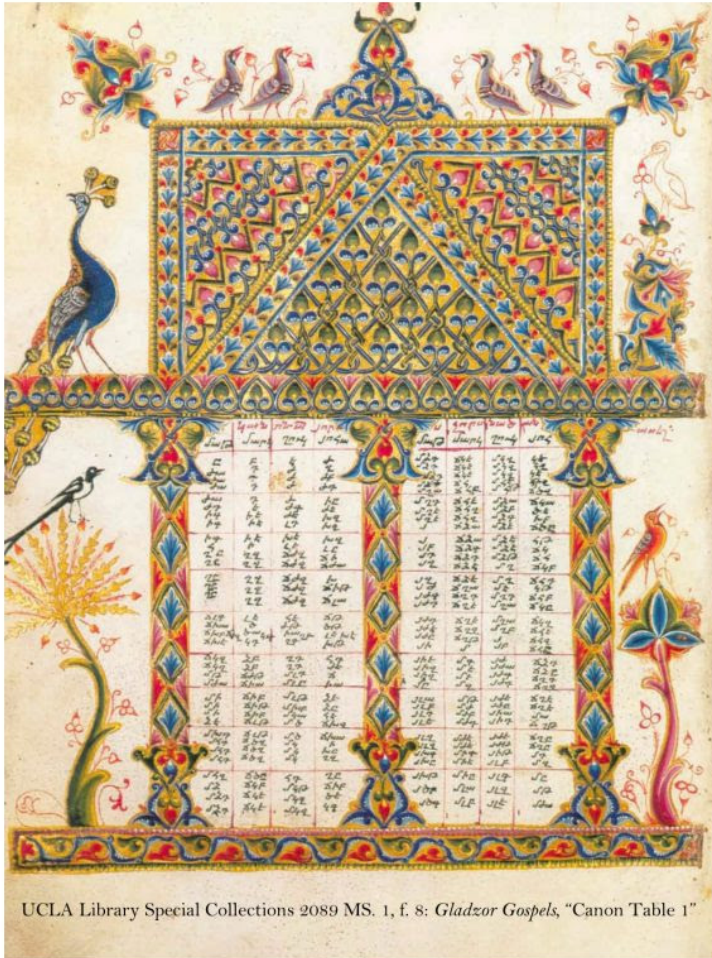
UCLA Library Special Collections 2089 MS. 1, f. 8: Gladzor Gospels , "Canon Table 1"

Both events will be held at UCLA, in Royce Hall 314, and will be followed by catered receptions.