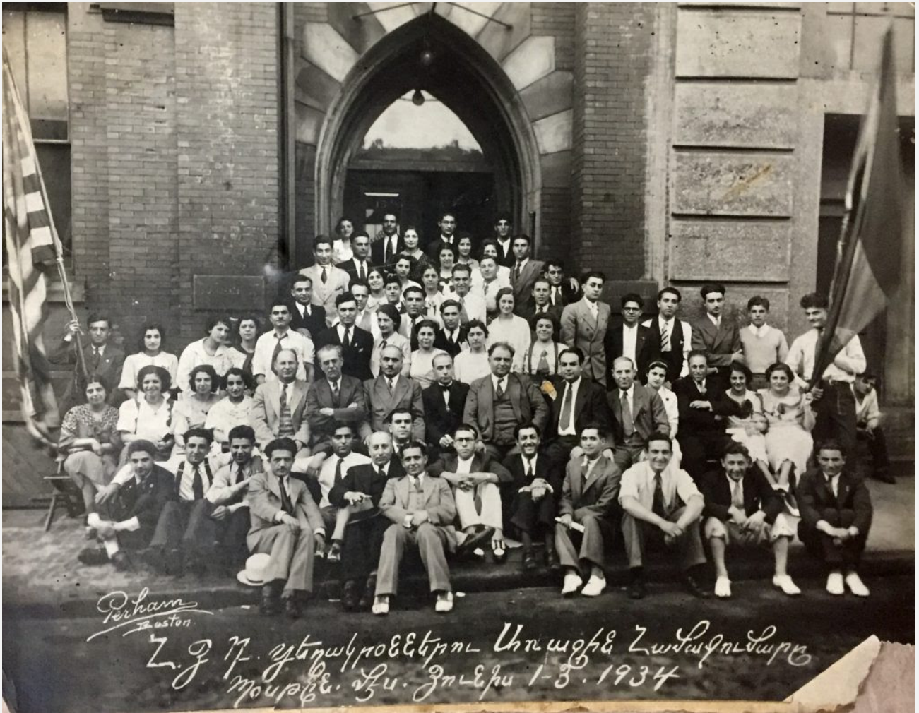
The delegates and guests at the first annual ARF Tzaghagron (AYF) Convention at the Hairenik Headquarters in Boston, June 1-3, 1934

Picture this: Armenian youth across the U.S. have gathered at the Hairenik Hall in Boston on a Friday night in June of 1934. Legendary statesman and military strategist Karekin (Garegin) Nejdeh and Justice Minister of the First Republic of Armenia turned Editor of the Hairenik Daily newspaper Reuben Darbinian deliver remarks after the singing of “ Harach Nahadag. ” In the midst of the gathering, the Armenian Revolutionary Federation (ARF) Central Committee of America gifts the youth in attendance a tricolor flag in a time when no independent Armenian Republic exists.