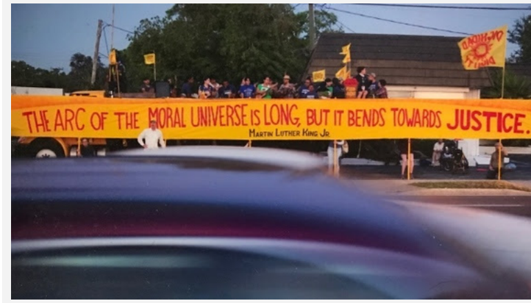
A photograph from one of CIW's rallies in 2016

Many of us would like to believe that the power to change the world lies in the hands of consumers—but does it actually?