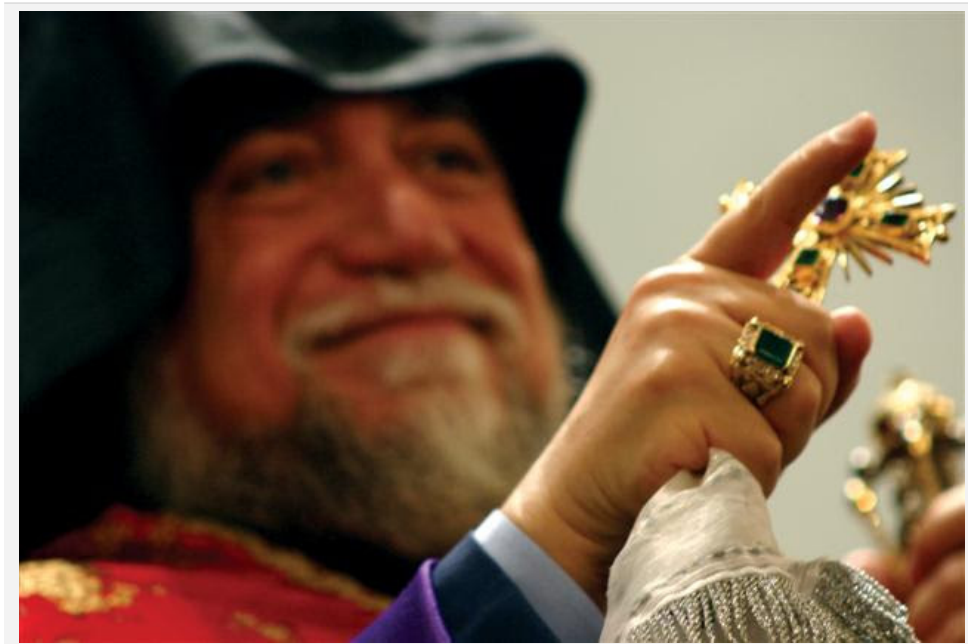
Catholicos Aram I

ANTELIAS, Lebanon—His Holiness Aram I, Catholicos of the Great House of Cilicia, has declared 2018 “The Year of Independence” to mark the centennial anniversary of the first Republic of Armenia.